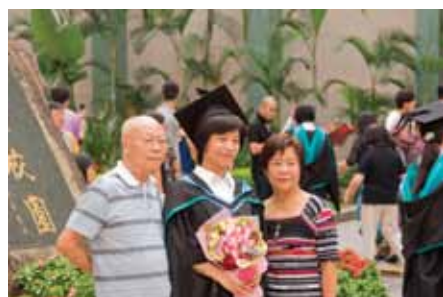
Hong Kong Graduation Ceremonies