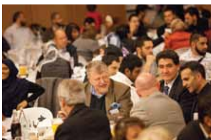
'Breaking of fast' dinner