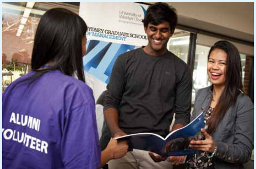
Alumni volunteers at Open Day